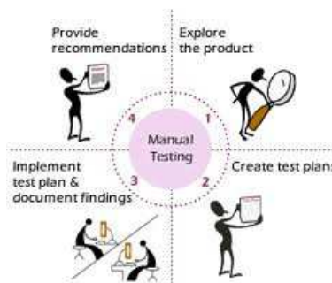
Figure 1: Manual Testing Lifecycle

Manually a website can be tested using the steps as shown in the figure.